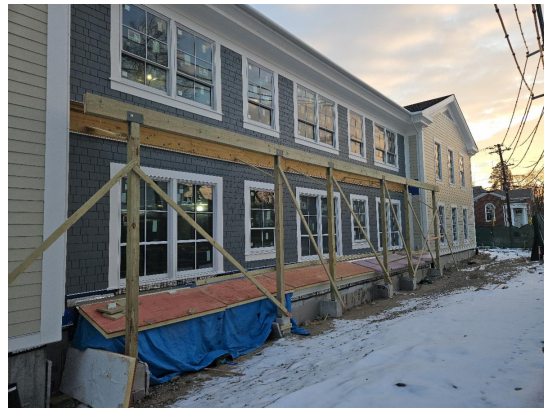
School Street side of new Library

Construction updates and photos may be found at the Town's website under Quick Links - Building Projects - Library Project In Progress .