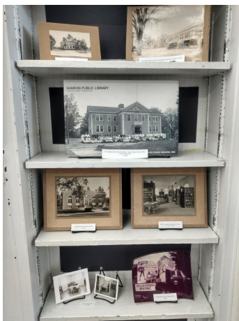
Exhibit: SPL History

Historic photos of the Sharon Public Library are on display by our main entrance. Come take a look at the history of the Library, from early shots of the inside of the Carnegie historic building, to the 1980 renovation, to the 90s opening of the computer center, and more! Photos will be up all month as we celebrate everything that's happened in this building and anticipate even more activity in our new one!