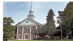
Eastern Nazarene College in the Wollaston neighborhood of Quincy is closing after more than a century in the city.